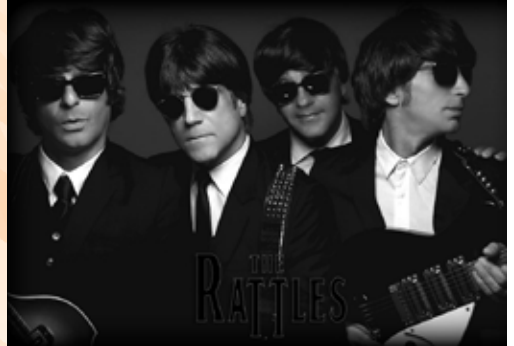
The Rattles Beatles, Tribute Concert 🍷 Saturday, 7:00 PM