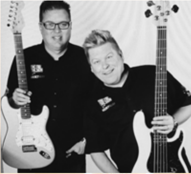
Two for the Show 🍷 Friday, 7:30 PM