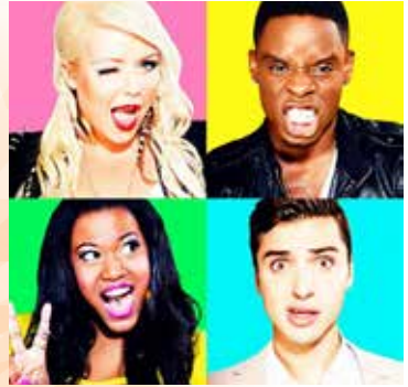
Reverse 🍷 Saturday, 2:45 PM